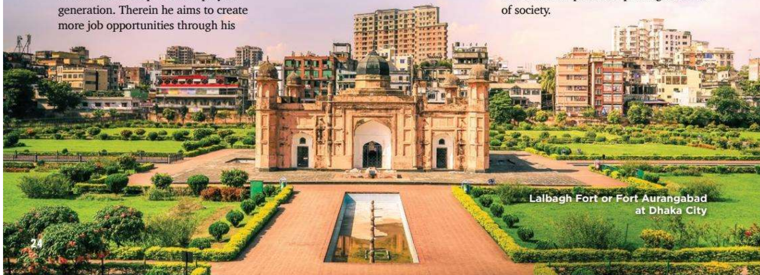
Lalbagh Fort or Fort Aurangabad at Dhaka City